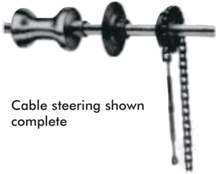
Cable steering shown complete