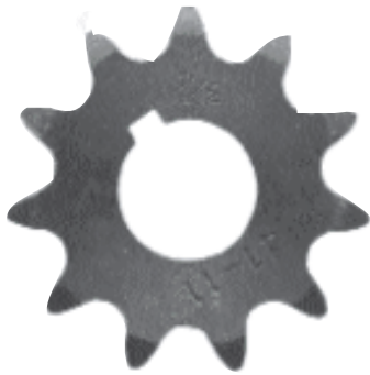
SPROCKET 11 TOOTH