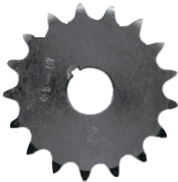
SPROCKET 17 TOOTH