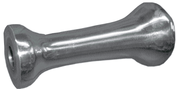
STEERING POST - 6 3 / 4 "