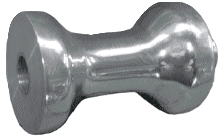
STEERING POST - 4"