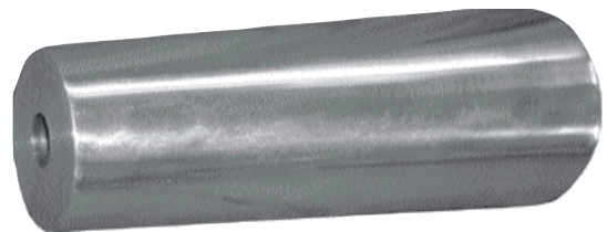
STEERING POST - 10"